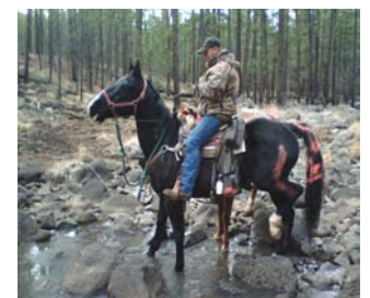
Rifle Bull Elk Hunt in 6A

A tall tree and a good rope can solve a lot of the worlds problems